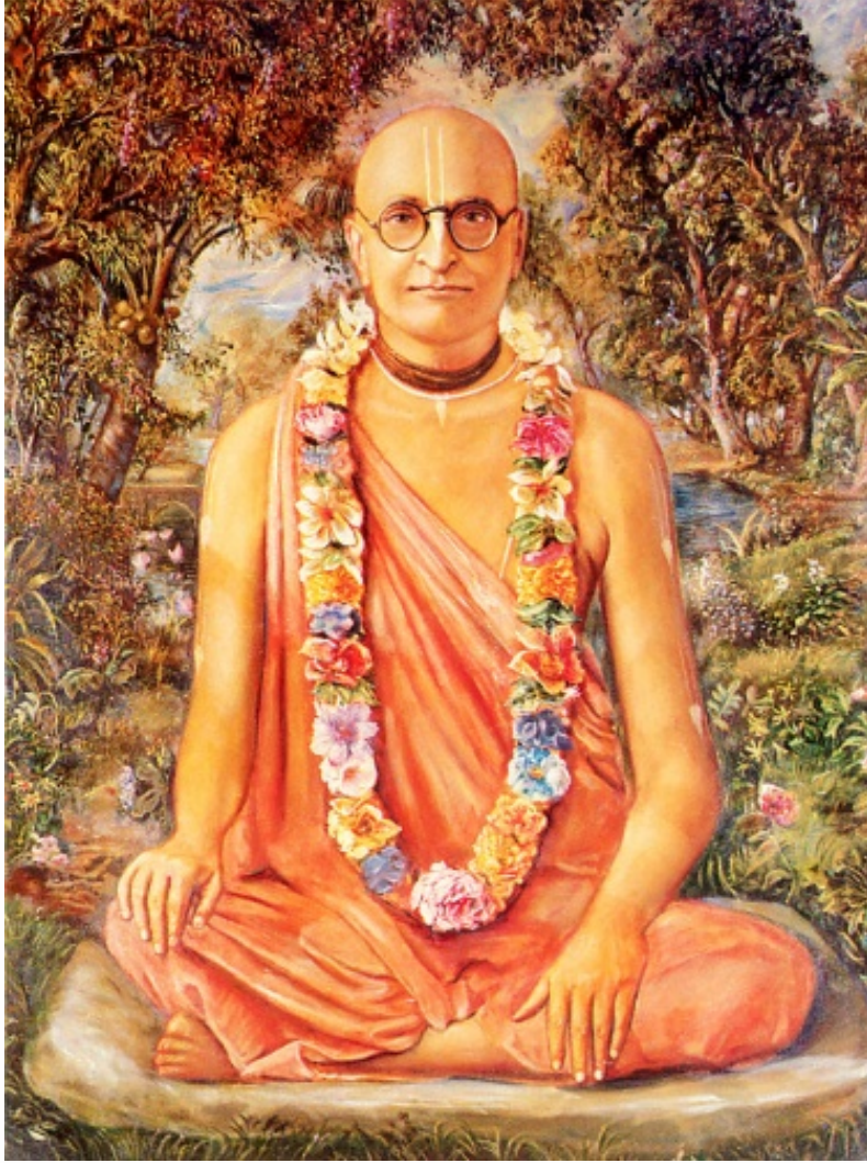
Founder and Acharya of the Gauḍīya Math His Divine Grace Śrīla Bhaktisiddhānta Sarasvatī Goswami Ṭhākura (1874-1937)

Śrīla Bhaktisiddhānta Sarasvatī Ṭhākura was born in the holy pilgrimage place of Jagannātha Purī to Śrīla Bhaktivinoda Ṭhākura, a great Vaiṣṇava ācārya in the line of succession coming from Śrī Chaitanya Mahāprabhu. Although employed as a government magistrate, Śrīla Bhaktivinoda worked tirelessly to establish the teachings of Lord Chaitanya in India. He envisioned a worldwide spiritual movement and prayed for a son to help him achieve his dream.